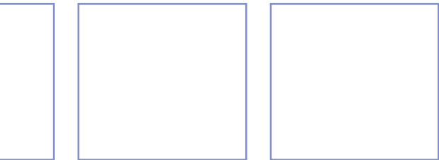
Niro Fabrication in Hudson, WI., USA

Niro is an international engineering company with more than 30 operating companies throughout the world, specialized in the design, manufacturing, integration and installation of process equipment such as spray dryers & coolers, fluid bed processors, agglomerators, powder packaging and handling systems, membrane filtration plants, high-pressure pumps and homogenizers, evaporation and distillation systems, tablet presses, and similar equipment to the food, dairy, chemical, and pharmaceutical industries.